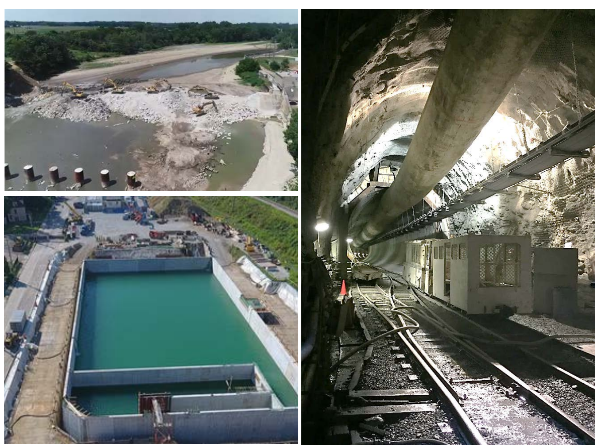
Division of Environmental and Financial Assistance (DEFA) December 20, 2019